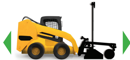
Grades in both directions to help optimize productivity

The unique frame design gives operators exceptional control, efficiency and smoothness, and eliminates the "bounce" effect common in skid steer loaders due to the short wheelbase.