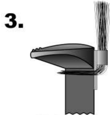
Slip bent loop onto spike with flat side of bracket against spike