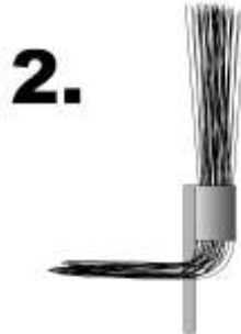
Bend loop of strands so they are on opposite side from metal ears