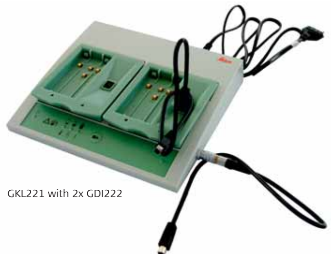
GKL221 with 2x GDI222

The microprocessor controlled charging station recognises the type of battery connected and derives the charging parameters such as time and current. The batteries are optimally and appropriately charged. This guarantees the maximum possible service life. The charging station can recognise and charge cells of the NiCd, NiMH and Li-Ion types. Up to five batteries can be connected to the charger simultaneously. Two batteries are charged at the same time and the rest are charged in the order they were connected.